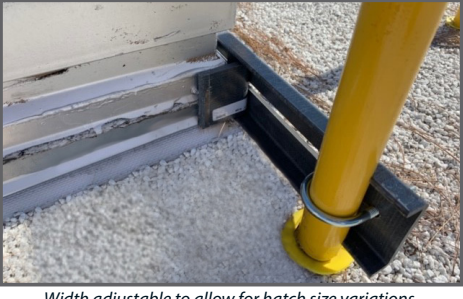
Width adjustable to allow for hatch size variations.