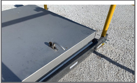
Unique compression fit design. No drilling!