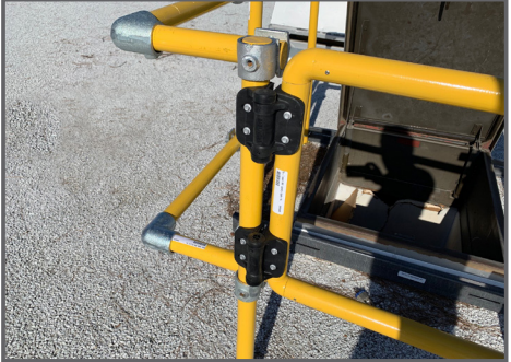
Rugged hinges allow gate tension adjustment.